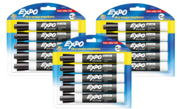
3 packs of Black dry-erase markers