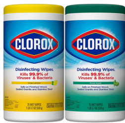
2 containers of disinfectant wipes