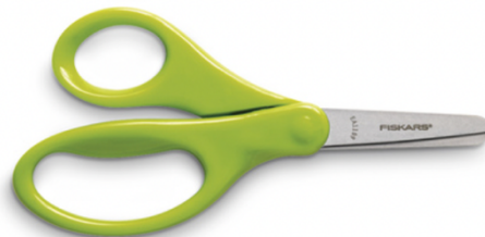
1 pair of scissors