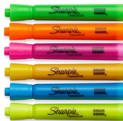
1 pack of multi-colored highlighters