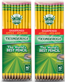
2 packs of pencils (pre-sharpened)