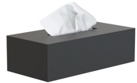
1 box of tissues