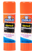
2 glue sticks